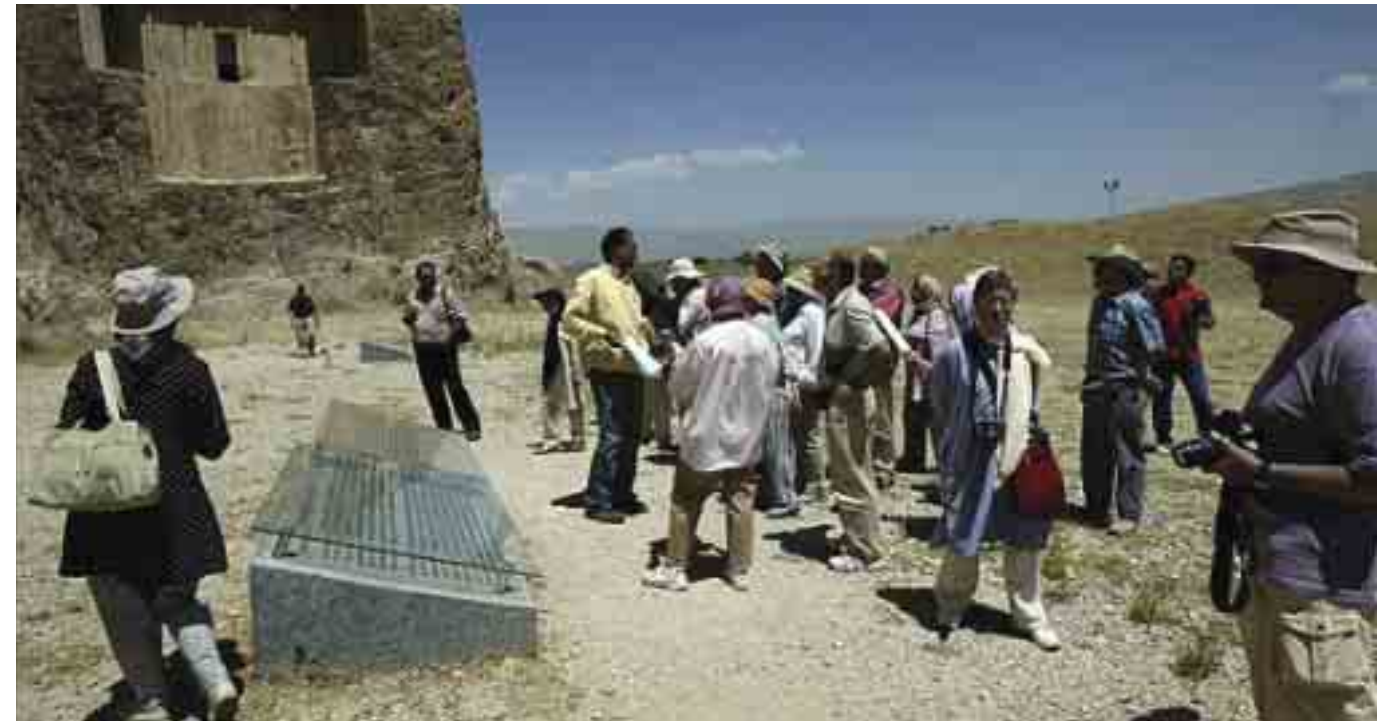
Naqsh-e Rustam, an archaeological site located about 12 km northwest of Persepolis in Fars province