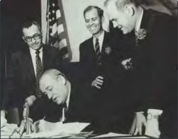
Gov. Winthrop Rockefeller signing the Arkansas Freedom of Information Act into law on February 14, 1967.