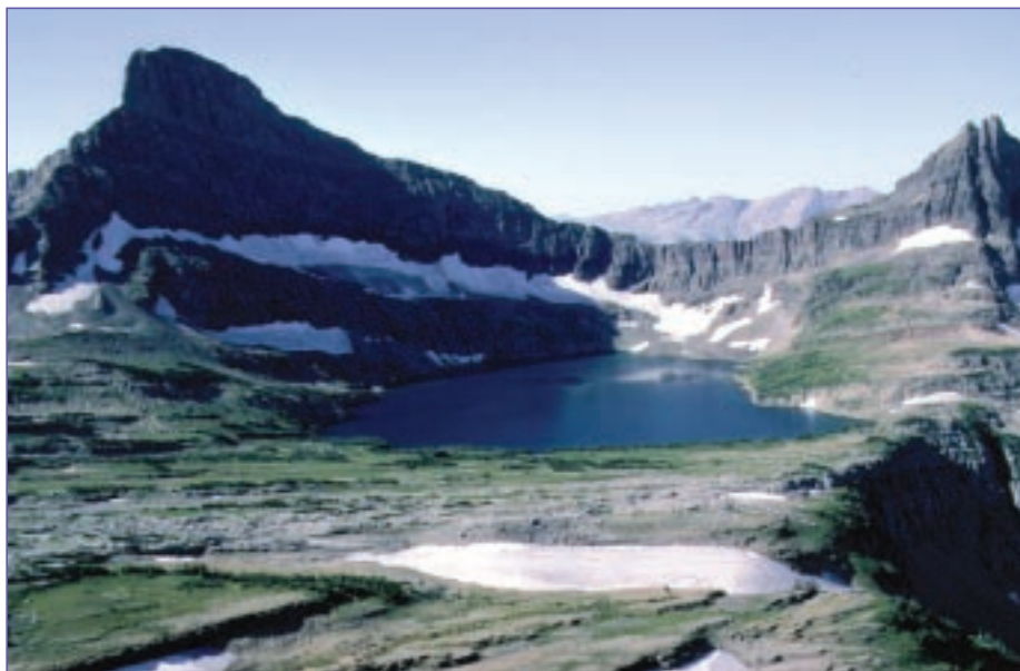
Figure 2. Example of Glacier Park terrain after major glaciation. Mount Kipp is on the left, and Sue Lake is in the center of the photograph.

Glacial retreat is of particular significance in relatively unmodified natural systems such as Glacier National Park, because these protected areas function as early warning systems. In fact, national parks have been likened to the caged canaries that long ago were carried into coal mines. Signs of distress from the birds signaled the presence of dangerous levels of gases that could not easily be detected in any other way. Likewise, parks often provide the first tangible evidence of an ecosystem response attributable primarily to climate change.