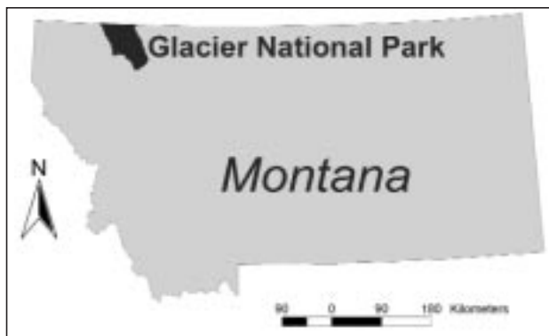
Figure 1. Location of Glacier National Park, Montana.

change. Although many abiotic aspects of ecosystems, such as stream hydrology, are greatly modified by plant community responses to changed conditions, glaciers are merely a physical reflection of the surrounding conditions. Moreover, they provide a signal that integrates climatic change over time, because they do not respond to year-to-year variability. Rather, they change their dimensions and mass slowly in response to decadal trends in climate. Thus, the global retreat of glaciers can be attributed to real climatic changes, not to temporary anomalies.