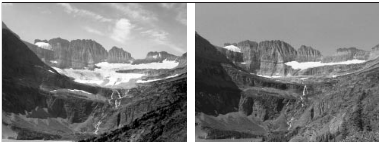
Figure 3. Historic and recent photos of Grinnell Glacier. Taken from the same point, the photographs clearly demonstrate the retreat of Grinnell Glacier over 88 years.

ring data showed that before 1910 glaciers retreated at a modest rate ( < 7 m per year). That rate increased dramatically between 1917 and 1926, reaching more than 40 m per year. Above the tree line, Carrara and McGimsey used terminal moraines, naturalists' notes, photographs, and park records to deduce that the glaciers retreated rapidly ( > 100 m per year) between 1926 and 1932 and continued to retreat at more than 90 m per year until 1942. This period of accelerated retreat corresponds to a period of above-average summer temperatures in the climatic record of the region (figure 4). After the mid-1940s the rate slowed, but ablation continued. Carrara and McGimsey estimated that 21.6 square kilometers ( \text{km}^2 ) of ice existed in the Mount Jackson–Gunsight Basin area in 1850. By 1979 it had been reduced to 7.4 \text{km}^2 . Of the original 27 glaciers in the basin only 10 remained. Most of those that had disappeared were either small or oriented due east. Blackfoot Glacier, originally 7.6 \text{km}^2 , divided into seven glaciers measuring approximately 3.0 \text{km}^2 in total area; the largest of these are Jackson and Blackfoot.