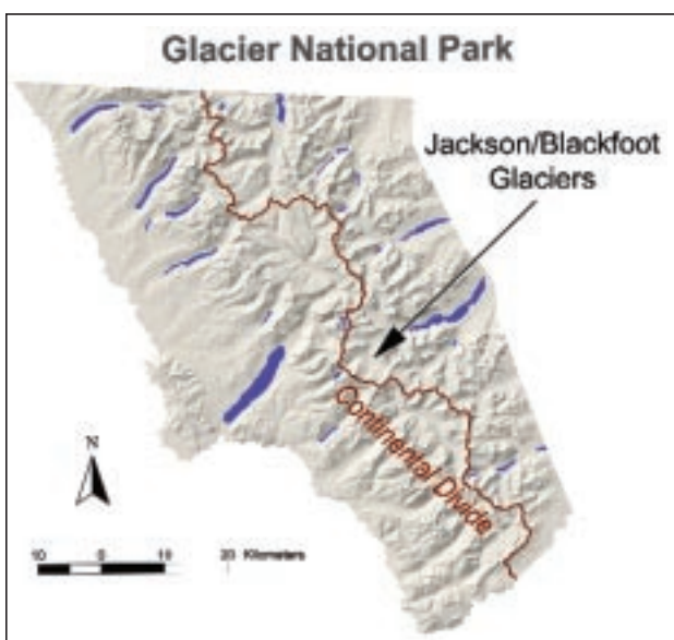
Figure 6. Location of the study area for the development of the glacial retreat model.

As in Oerlemans's analysis, our data revealed a 10- to 25-year lag between significant climatic swings and glacial termini response. The cooling and heavy snow accumulation of the 1950s resulted in the advance of several glaciers in the basin during the 1970s. Thus the glacial response we are seeing now must be integrating the climate changes of several decades past. Because most of Glacier National Park's larger glaciers were valley glaciers in 1850 but are now cirque gla-