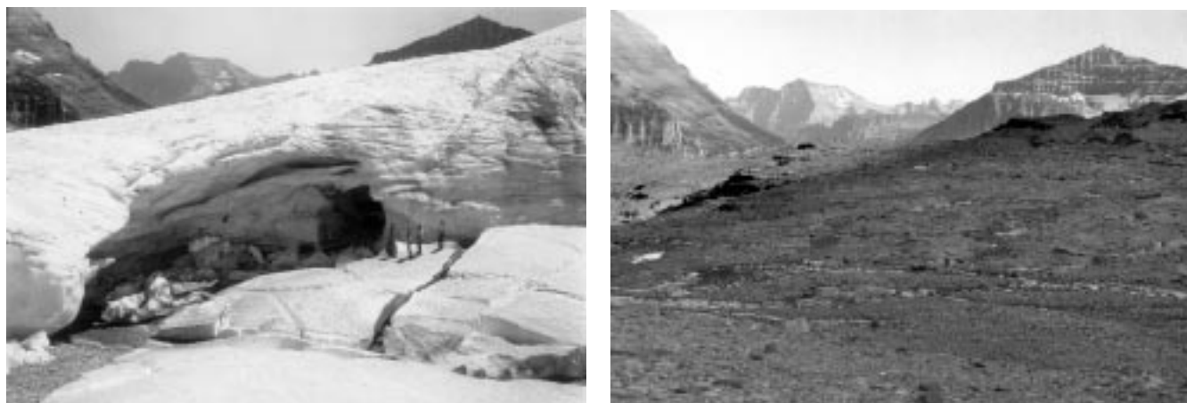
Figure 5. Boulder Glacier: 1932 (left), 1988 (right). These two views of Boulder Glacier demonstrate the dramatic reduction in ice in Glacier National Park and its ecological consequences. Vegetation has moved in where the ice cave used to be.

summer temperature–induced melting or to winter (or annual) precipitation–derived snow accumulation. Posamentier (1977) analyzed the effects of both types of forcing. He found that together they explained about 70% of observed terminus variation since 1900. Hoinkes (1968) showed a correlation between the percentage of Alpine glaciers that advanced and both summer precipitation and temperature deviations from the mean. Martin (1974), using multiple regression to evaluate 16 years of measured mass balances in the Alps, found that deviations from the mean of both annual precipitation and May–August temperatures explained between 73% and 90% of the variation in mass balance. Tangborn’s model (1980) for estimating climate–mass balance relations for the Thunder Creek Basin glaciers in the North Cascades of Washington State suggests that the relation is highly sensitive. It appears from his studies of volume changes (from 1884 to 1974) that a decrease in summer air temperature of just over 0.50°C or an increase in winter accumulation of slightly more than 10% (350 mm) from the 1920–1974 average would cause these glaciers to grow continuously.