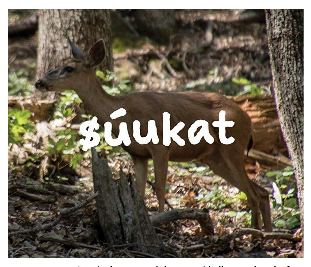
Figure 3. Basquez (2018). The proposed character \langle s \rangle illustrated on the front cover of a Luiseño primer.